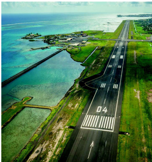
Tahiti Faa'a International Airport