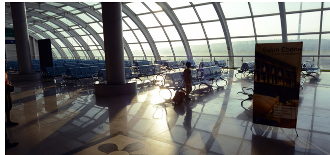
Brazzaville International Airport